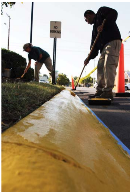
Jeff Riggsby and Sherry Hodskins with the Landscaping department at OMHS put a fresh coat of paint on the street curbs near the Parrish Medical Office Building.