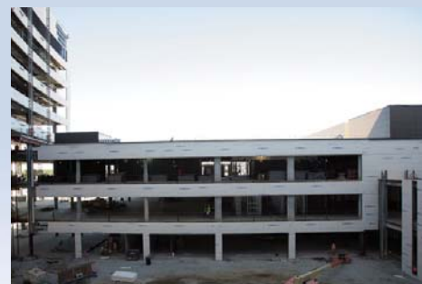
The main courtyard starts to take shape as work continues on the surrounding buildings.