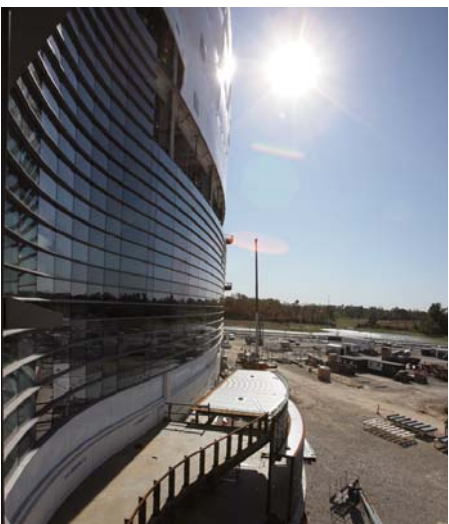
The sun reflects off the glass façade.