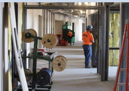
A hallway takes shape in the bed tower.