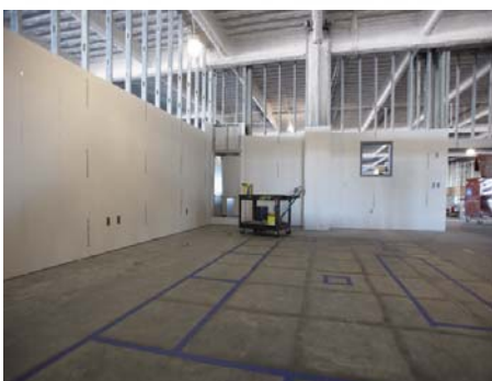
Blue tape marks areas where equipment will sit in the operating rooms.