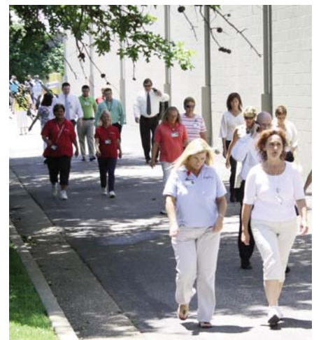
Staff at the OMHS Business Center take a walk as part of the ongoing wellness initiative.