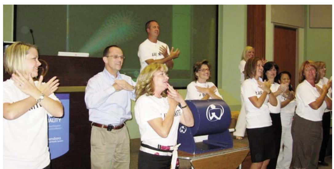
OMHS staff get up and dance as part of a flash mob at the kickoff of the United Way campaign in the conference center. The campaign runs from September 6th through the 23rd.