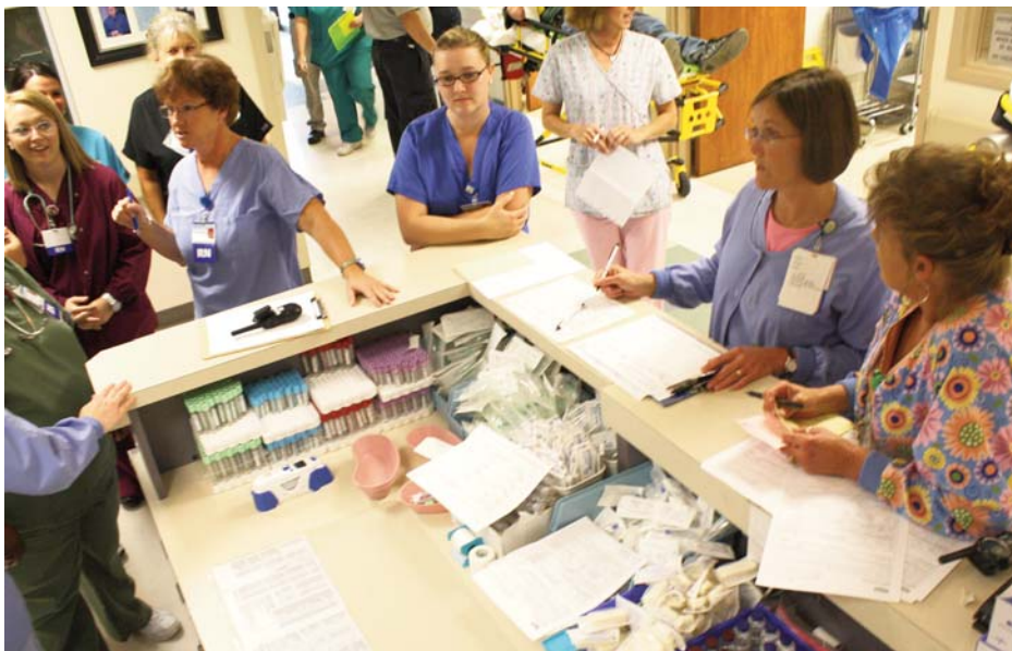
Staff in the Emergency Department get instructions as patients start rolling in during Tuesday's disaster drill. The scenario was a plane crash at the Owensboro Daviess County Regional airport with 150 people on board and dozens of people injured. Many of the victims that participated in the drill were taken to OMHS for treatment.