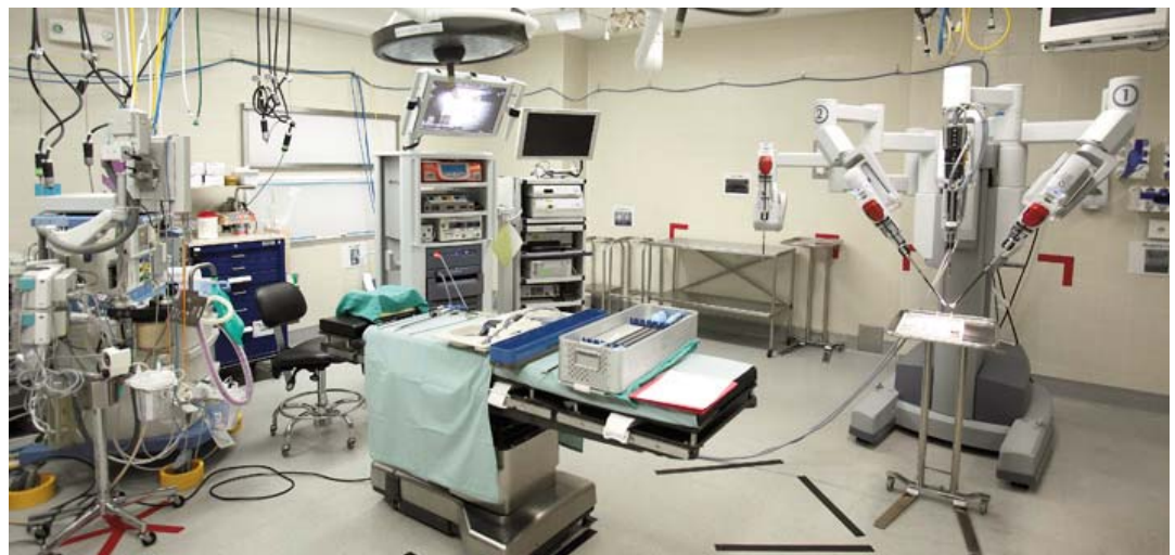
Pictured above is one of the operating rooms at OMHS outfitted with the da Vinci surgical system. You can see the console on the right-hand side of the picture. Several practices use the da Vinci including cardiac, thoracic, obstetrics, gynecology and others.