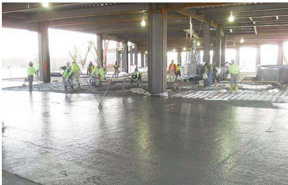
Workers with Baker Concrete pour the floor of one of the levels of the new bed tower. Steel erection will continue through the winter months and will be finished in the spring of next year.